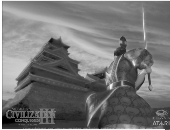
A scene from Civilization.